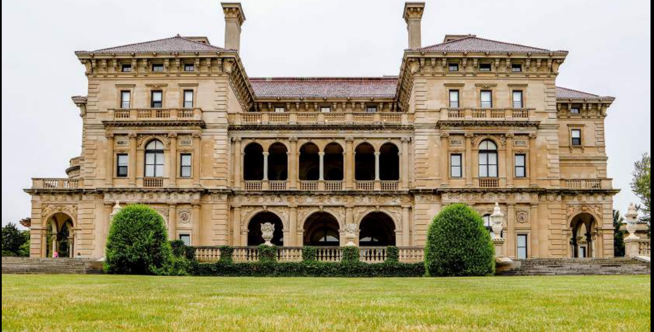
Vanderbilt Summer Cottage