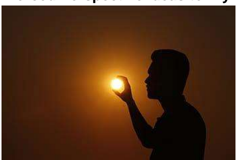
Forced Perspective Ideas to Try