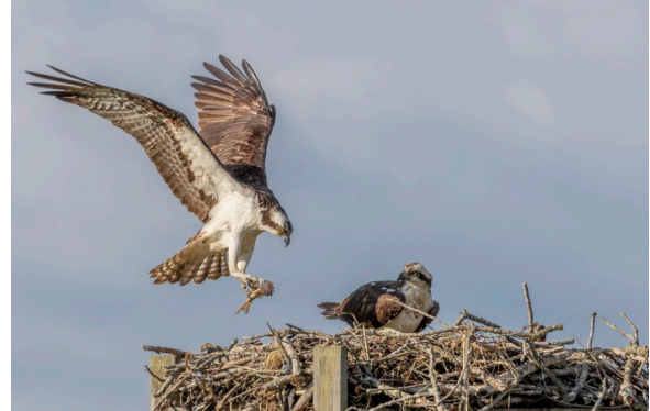
“Breakfast is Served” by Sandy Schill 2023 Annual Competition - Best in Show