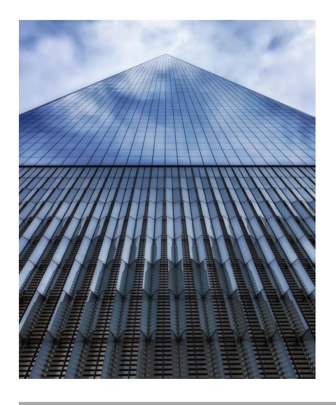
Table of Contents Congratulations to our winners!All Photos with Photographer and TitleVideo Recording of the Judges Scoring the Photos Congratulations to our winners! Assigned Subject – Architectural Detail Monthly Challenge – Steam or Smoke Nature Open Color - Class A Open Color - Class B Open Monochrome - Class A Open Monochrome - Class B Copyright The copyrights for all ...