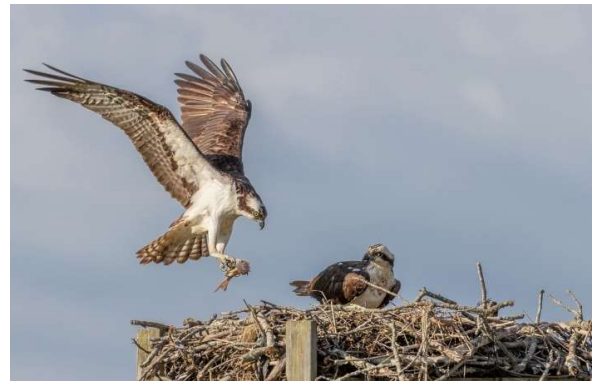
Table of Contents Congratulations to our winners! All Photos with Photographer and Title Video Recording of the Judges Scoring the Photos Congratulations to our winners! Best in Show Creative Landscape – Includes Cityscapes, Waterscapes ... Nature Open Color Open Monochrome Judge's Choice People's Choice Copyright The copyrights for all photographs appearing on this website are owned by the photographer. And as such, ...