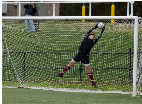
Table of Contents Congratulations to our winners! All Photos with Photographer and Title Video Recording of the Judges Scoring the Photos Congratulations to our winners! Assigned Subject – Photojournalism Monthly Challenge – Stairway Nature Open Color - Class A Open Color - Class B Open Monochrome - Class A Open Monochrome - Class B Copyright The copyrights for all photographs appearing on ...