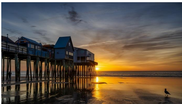
Table of Contents Congratulations to our winners! All Photos with Photographer and Title Video Recording of the Judges Scoring the Photos Congratulations to our winners! Assigned Subject – Beach Monthly Challenge – Window Light Open Color - Class A Open Color - Class B Open Monochrome - Class A Open Monochrome - Class B Copyright The copyrights for all photographs appearing on this ...