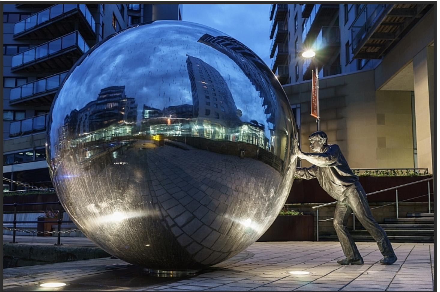
By Alan Newman - an1.uk