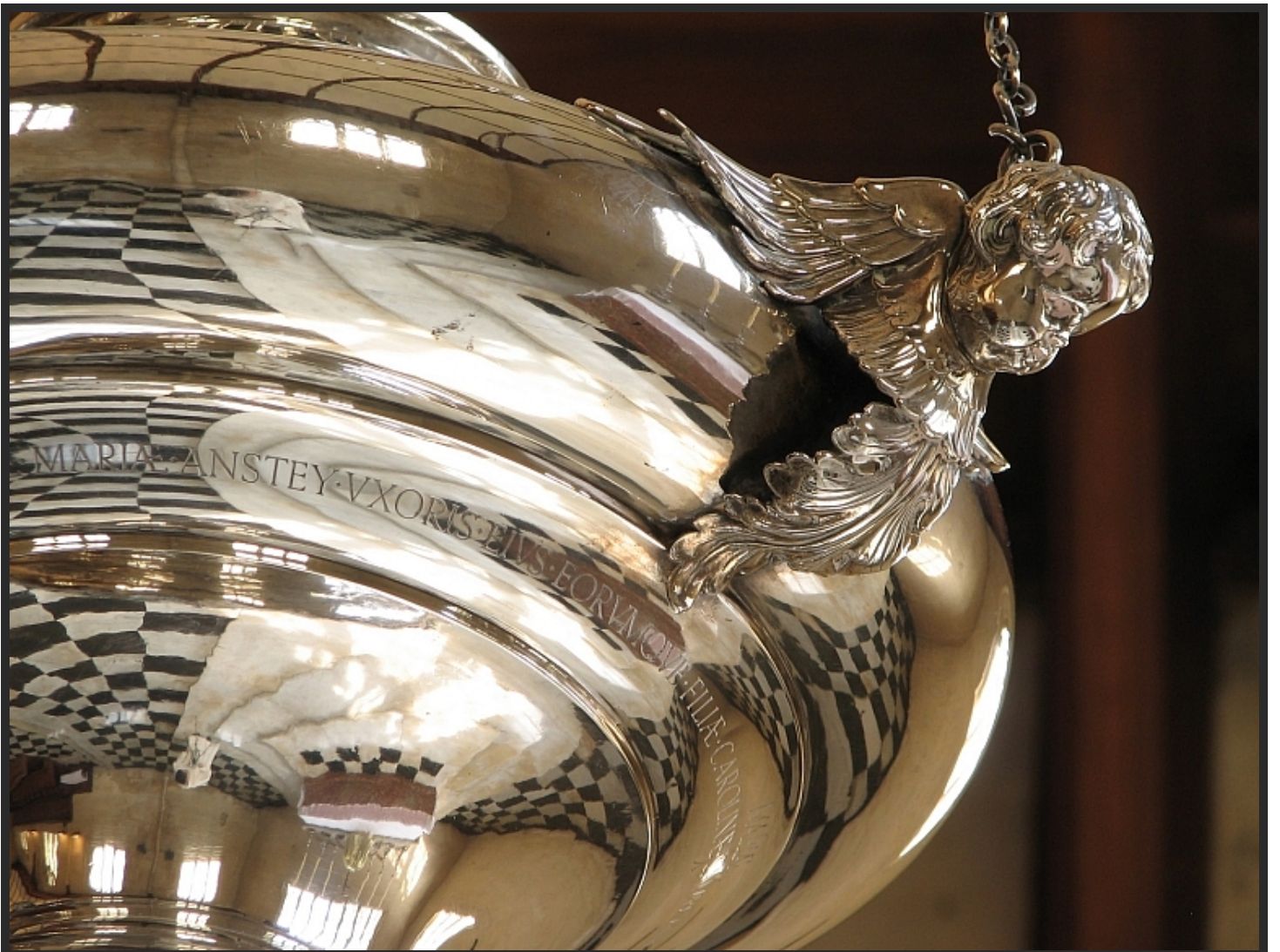
By Lawrence OP