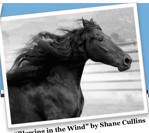
"Blowing in the Wind" by Shane Cullins