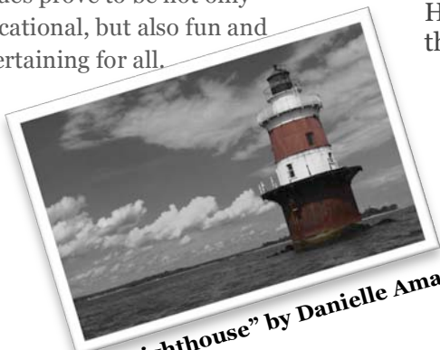
“Lovely Lighthouse” by Danielle Amato

A round table format proved very helpful for club photographers, with over 15 attendees working on fine-tuning their craft through open discussion. These informal venues prove to be not only educational, but also fun and entertaining for all.