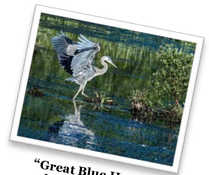
"Great Blue Heron" by Rick Tyrseck