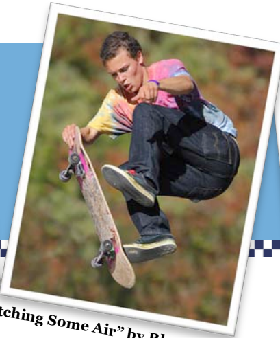
"Catching Some Air" by Rhonda Cullins