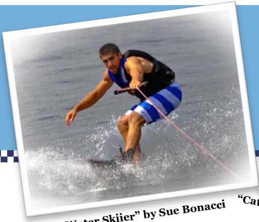
"The Water Skier" by Sue Bonacci