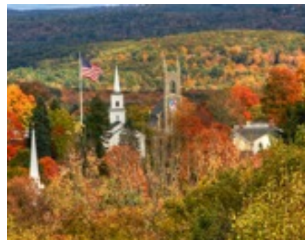
3rd. Place Assigned Iconic New England Sandy Schill