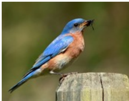
1st. Place Open Color Wasp for Breakfast Sandy Schill