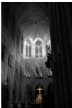
2nd. Place Assigned White Night Lights Donna White