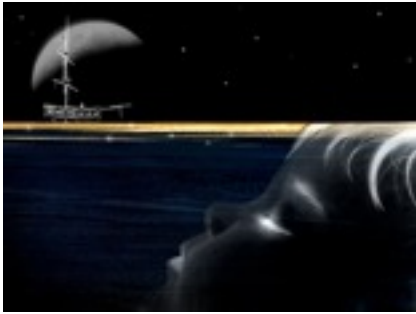
1st. Place Assigned Dream Scene Sheila Silvernail

Assigned Subject: A Different Point of View