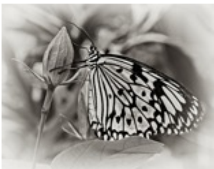
1st. Place B & W Open Please! Rick Tyrseck