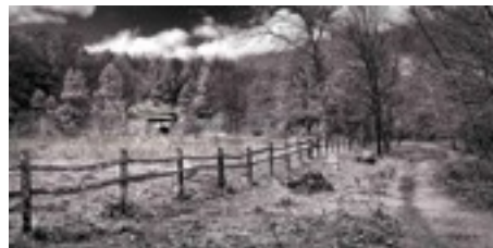
2nd. Place B & W The Road to South Britain Ercole Gaudioso