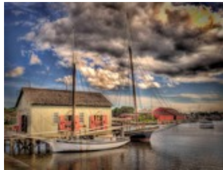
2nd. Place Open Color Boats at Oyster Shack Ercole Gaudioso