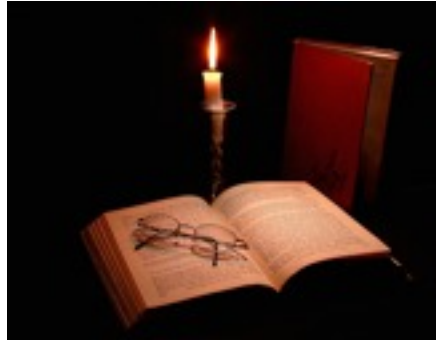
2nd. Place Assigned By Candlelight Sandy Schill