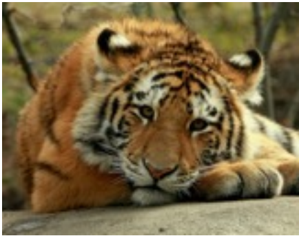
1st. Place Open Color Contemplating Sandy Schill