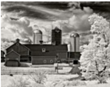
1st. Place B & W Blustery Afternoon Rick Tyrseck