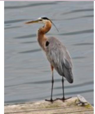
3rd. Place Open Color Blue Heron Fishing off the Deck Rhonda Cullens