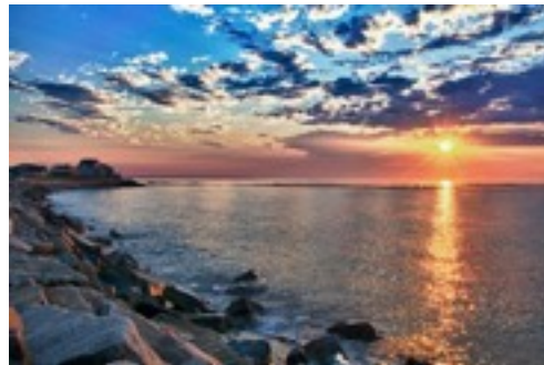
2nd. Place Open Color Morning Glow Darrell Harrington