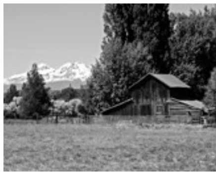
2nd. Place B & W Mountain View Ranch Rhonda Cullens