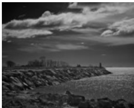
1st. Place B & W Sunset at Seaside Park Don Brooks