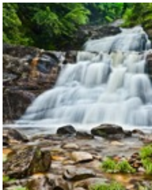
2nd. Place Open Color A View from Below Rick Tyrseck