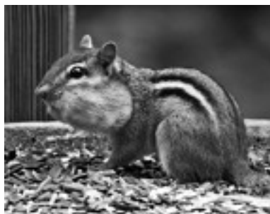
2nd. Place B & W Storing Up for Winter Rhonda Cullens