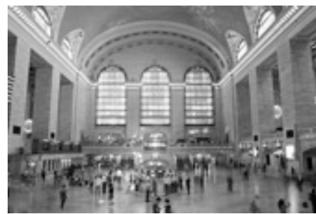
3rd. Place B & W Going Places Donna White