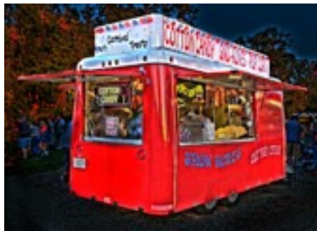
2nd. Place Assigned Cotton Candy Ercole Gaudio