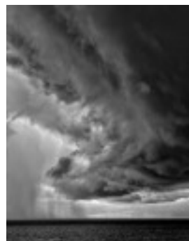
2nd. Place B & W Rick Tyrseck Severe Storm Front