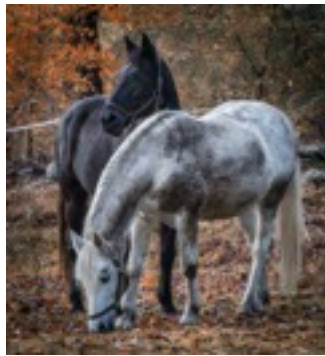
2nd. Place Open Color Ercole Gaudio Residents of Hidden Farm