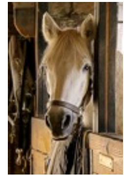
3rd. Place Open Color Rhonda Cullens Tess