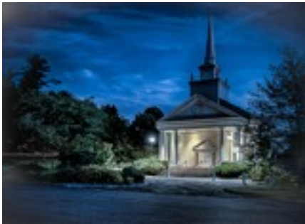
1st. Place Open Color Anne Eigen Newtown Congregational Church