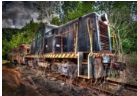
2nd. Place Open Color Railroad Graveyard Ercole Gaudio