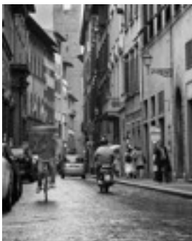
1st. Place B & W Rainy Street in Florence Don Brooks