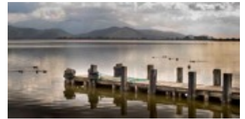
3rd. Place Open Color Puccini Lake Ercole Gaudio