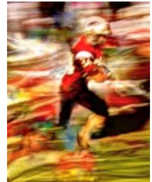
3rd. Place Assigned A Streaking Fullback Patty Powers