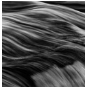
2nd. Place Assigned Flowing Water Rick Tyrseck