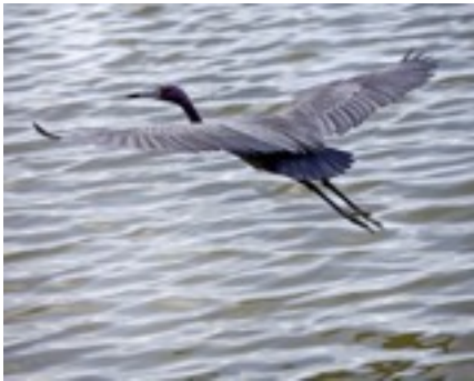
1st. Place Open Color Little Blue Heron in Flight Don Brooks