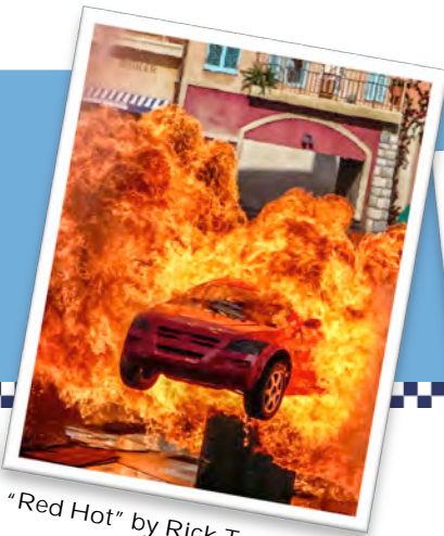
"Red Hot" by Rick Tyrseck