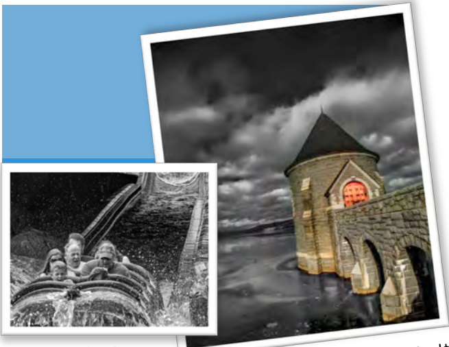
"Soaked" by Rick Tyrseck

Each month Flagpole Photography Camera Club holds print competitions featuring a specific subject theme. Although the themes have a variety of assigned subjects, it also features competition in open color, as well as black and white. Winner's photos have the opportunity to be submitted for judging by the New England Camera Club Council.