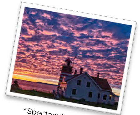
"Spectacular Sunrise" by Rick Tyrseck

Open discussion, in a round table format was held at LeReines Cuisine in Newtown. LeReines Cuisine exuded hospitality by offering club member warm beverages, scones and assorted homemade cookies. Members of all skill levels participated in the informal discussions, which included topics, such as "Actions" in Photoshop, Neutral Density Filters and reviewed Black and White techniques. These discussions are free, fun and open to all members!