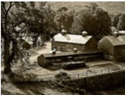
1st Place Open-B & W Vintage Barn Sheila Silvernail