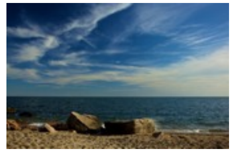
3rd Place Open-Color Hammonasset Beach Don Brooks