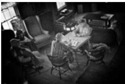
1st Place Open-B & W Men's Club Noir Ercole Gaudio