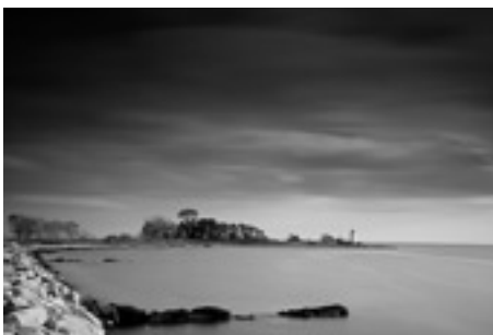
1st Place Open-B & W Seaside Park Lighthouse Don Brooks