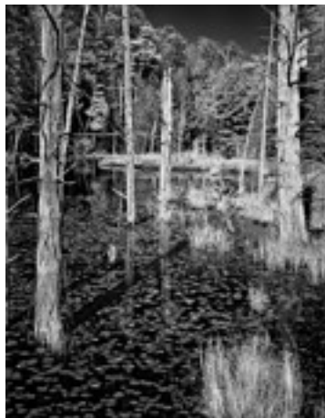
2nd Place Open-B & W Cedar Swamp Rick Tyrseck