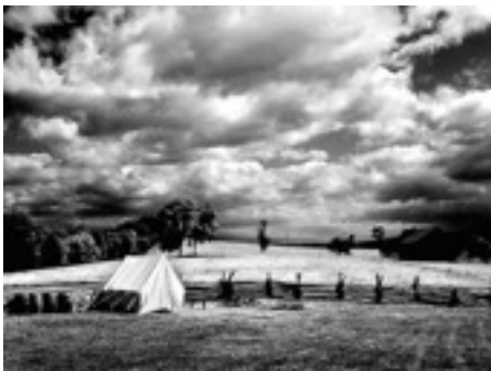
1st Place Open-B & W Battle Tent Sheila Silvernail