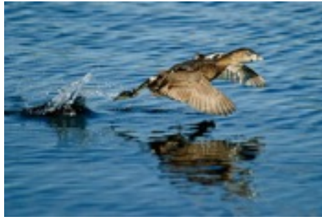
2nd Place Assigned Color Grebe Skimming the Waters Anne Eigen