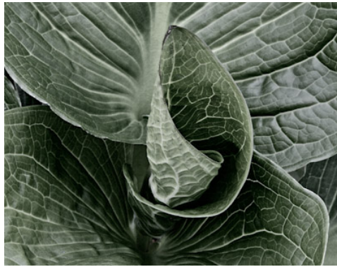
2nd Place Assigned A Plant's Nutrient Highway Rick Tyrseck