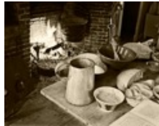
2nd Black and White Thanksgiving Recipe Handed Down Rick Tyrseck