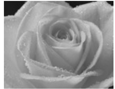
3rd Black and White Morning Kiss Donna White