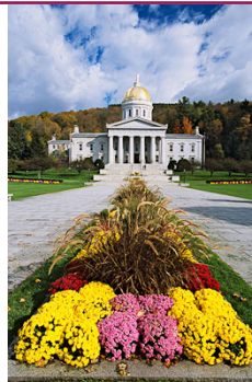
2nd Place Slides Vermont State House Rick Tyrseck