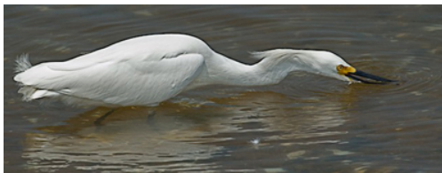
1 st Place Open- tie Going For Lunch Don Brooks