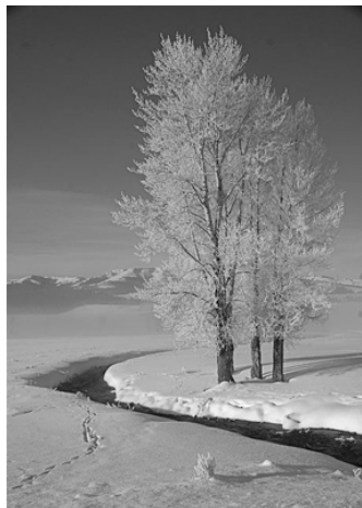
1 st Place Open- tie Frozen Cottonwoods Bob Berthier